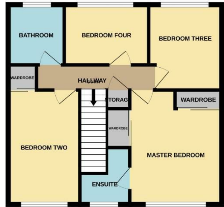
1ST FLOOR 576 sq.ft. (53.5 sq.m.) approx.