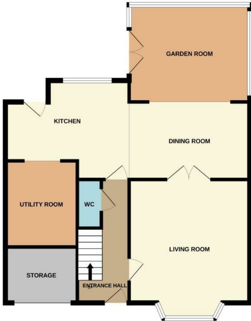
GROUND FLOOR 835 sq.ft. (77.6 sq.m.) approx.